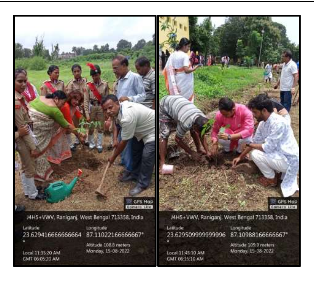
Mahogany saplings were planted in the college on the Independence Day on the occasion of Azadi Ka Amrit Mahotsav