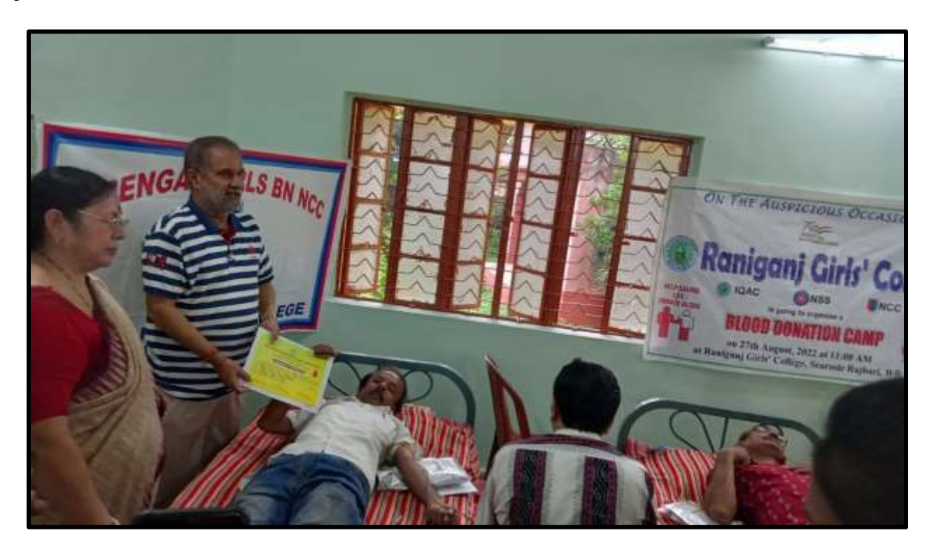
Blood Donation organized on 27^{th} August 2022 on the auspicious occasion of Azadi Ka Amrit Mahotsav